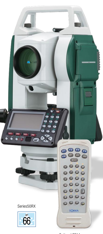
Optional SF14 Wireless Keypad